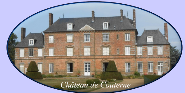
Château de Couterne